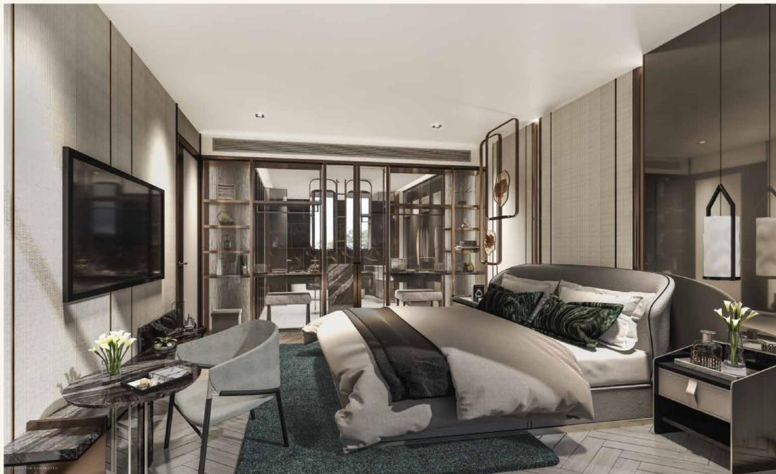
MASTER BEDROOM WITH GRAND BATHROOM