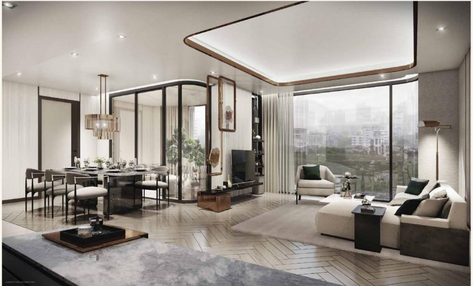
TWO BEDROOM UNIT WITH HIDEAWAY TERRACE