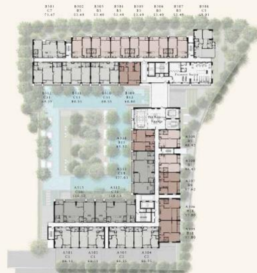
3rd FLOOR PLAN