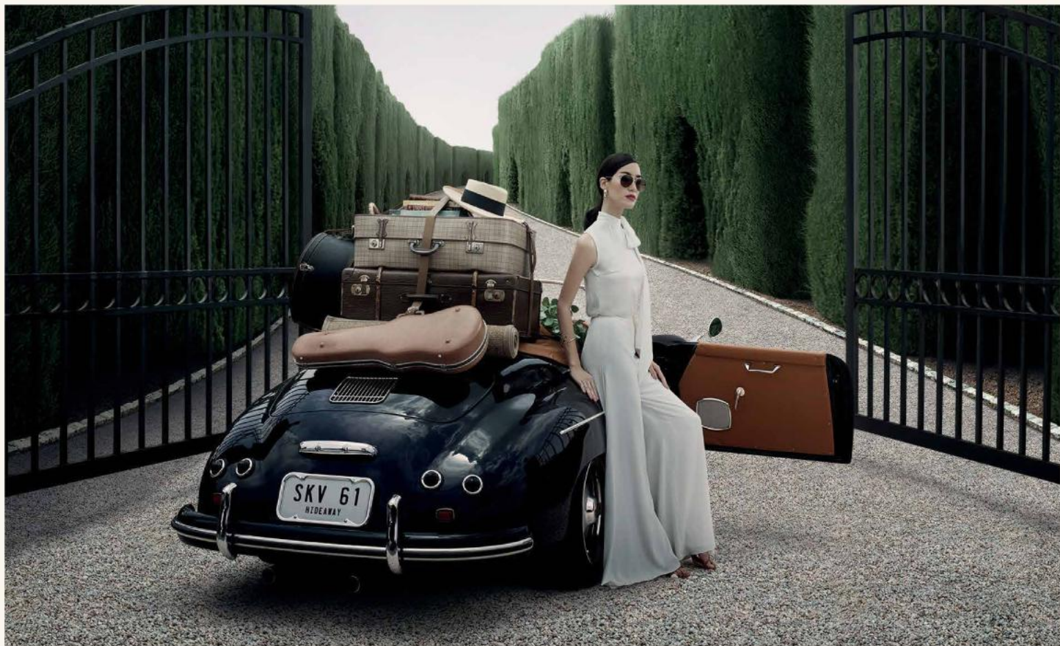
THE RESERVE 61 HIDEAWAY