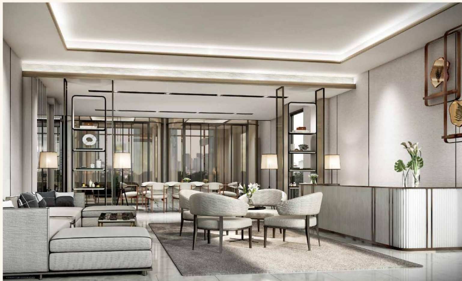
THE RESERVE LOUNGE