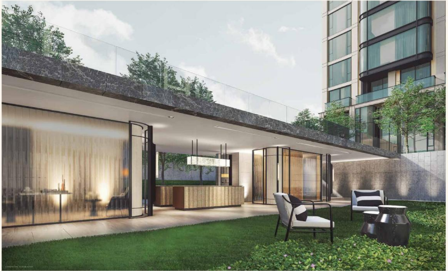
PRIVATE SALON & SPA