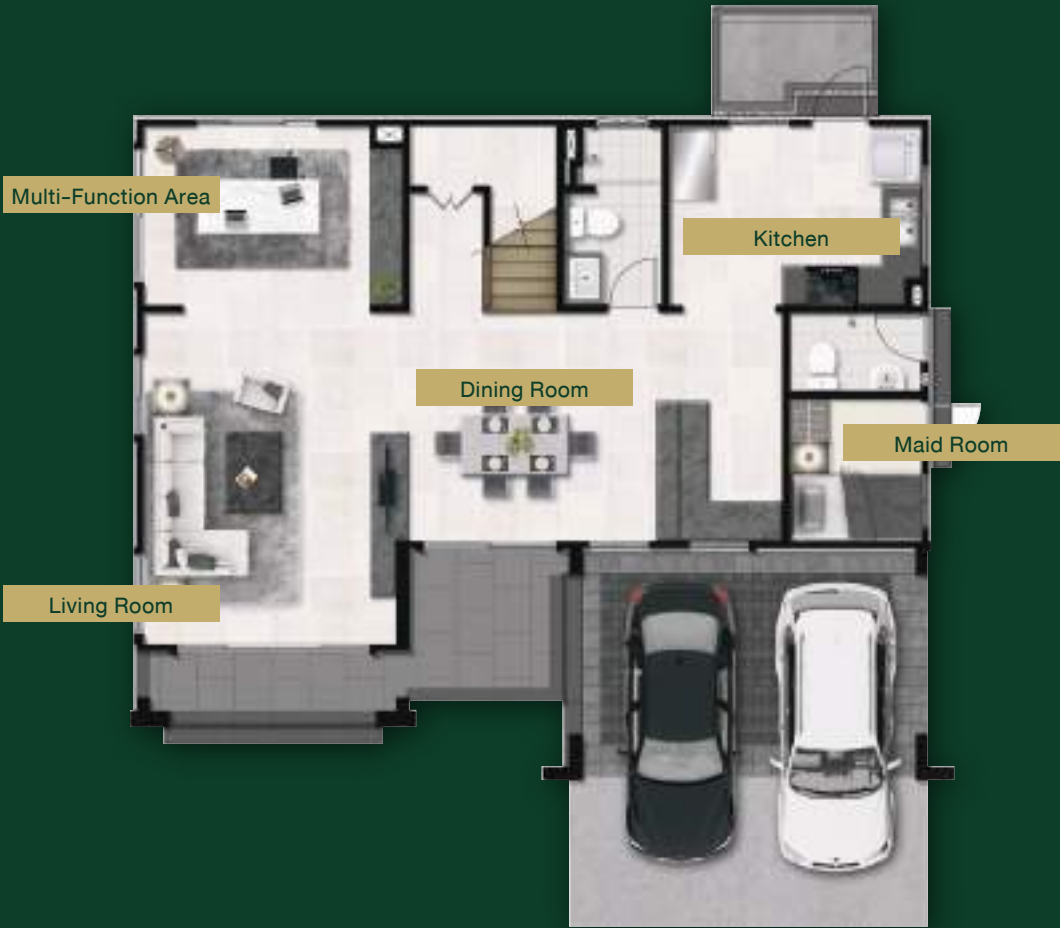
1 st FLOOR PLAN