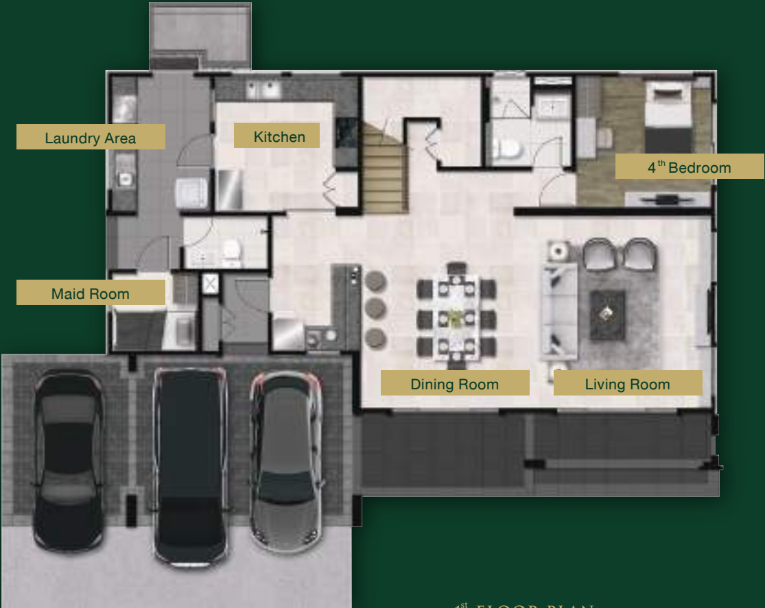
1 st FLOOR PLAN