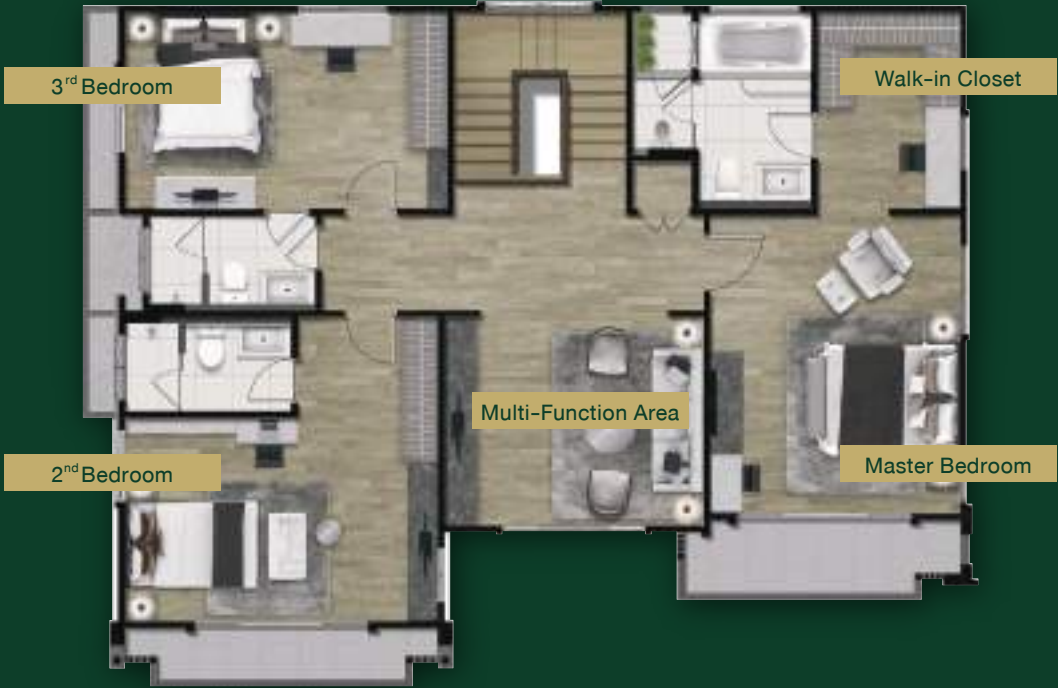
2 nd FLOOR PLAN