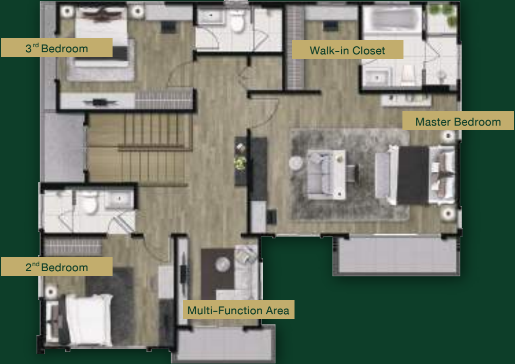
2 nd FLOOR PLAN