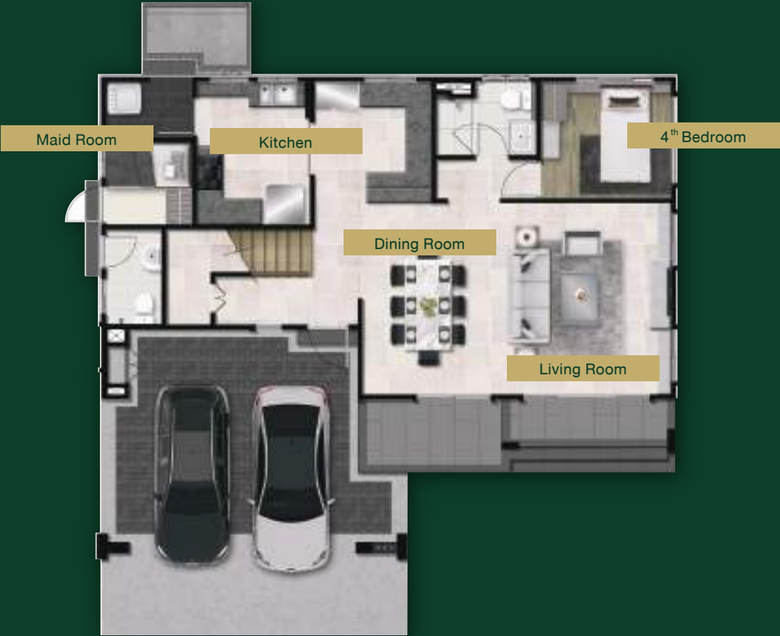
1 st FLOOR PLAN