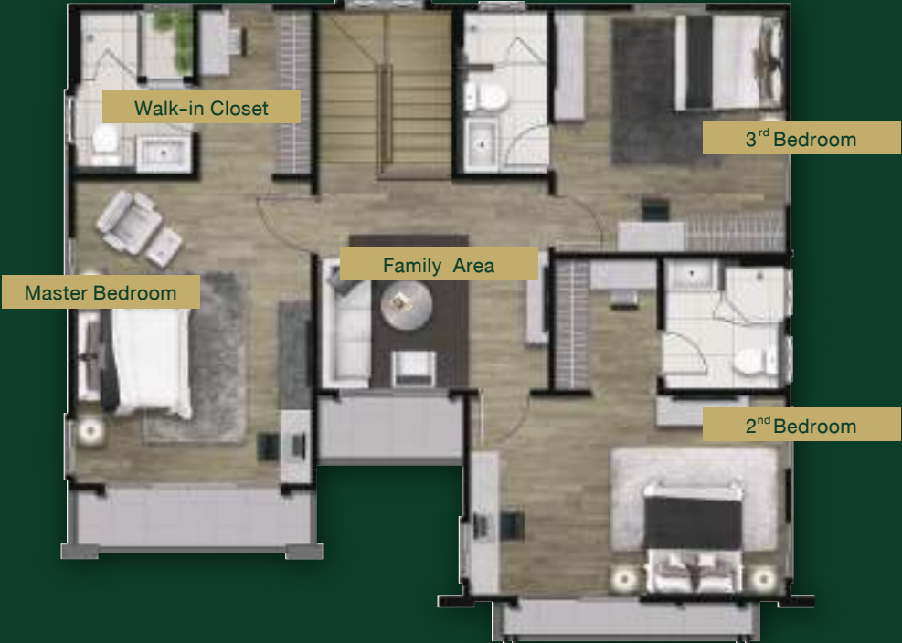
2 nd FLOOR PLAN